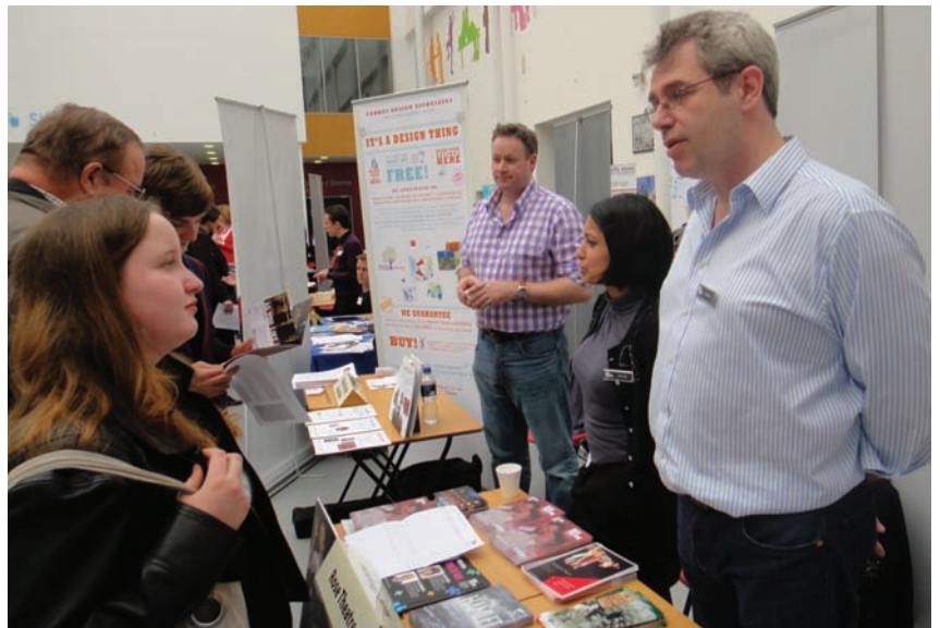
Above: Students talk to a representative from the Rose Theatre and Forbes Design Associates.

If you're interested, please contact the Chamber on 020 8541 4441 or email office@kingstonchamber.co.uk . If you attended in March, we'll be in touch.